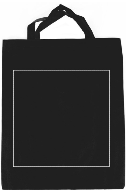
2. BACK BAG UNFOLDED