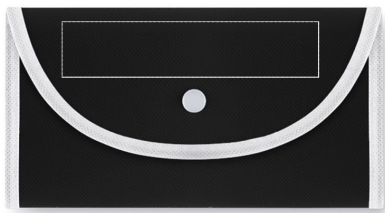
3. FRONT FOLDED