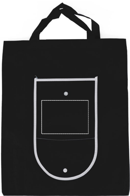
1. FRONT BAG UNFOLDED